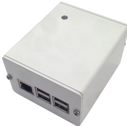
AV4 Configurator Tool

In response to these challenges, Nidec Industrial Solutions replaced the existing optical encoders at these fulfillment centers with our magnetic AV4 encoder. AV4 provides magnetic durability in a compact encoder and is a drop-in mechanical replacement for many optical encoders. Unlike optical encoders, magnetic encoders have no optical glass disks to be compromised by dust, dirt and liquids. AV4 has our Wide-Gap technology which provides for 10-20X larger air gap between sensor and rotor than ordinary optical encoder designs. Our Wide Gap technology allows for resistance to vibration.